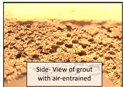
Side- View of grout with air-entrained

Prevention/ Repair: narrow \frac{1}{8} ” – \frac{1}{4} ” joints , will require a paste consistency for the grout when installing and the effort to completely compact and fill the joint . Damp cure your grout with clean water mopping once a day for 3- consecutive days after an over-night cure. This will also enhance the hardness of the grout. Remember voids and air-entrain are at the installing stages. The extra time to detail is a great advantage to the longevity and durability of the installation.