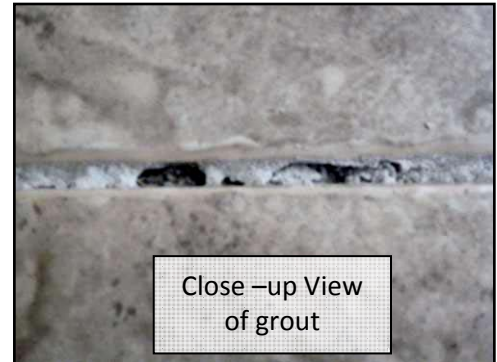
Close-up View of grout